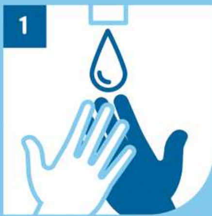
1 WET HANDS