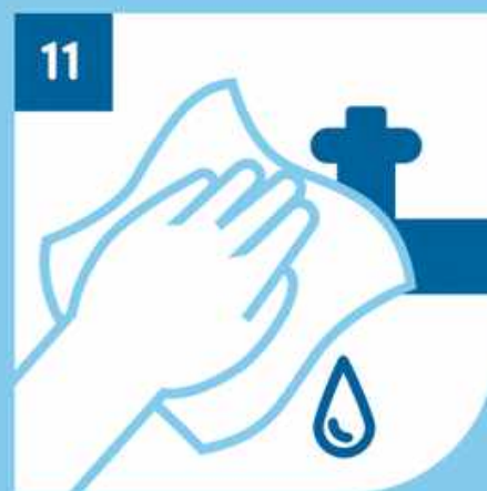
11 USE TOWEL TO TURN OFF THE TAP