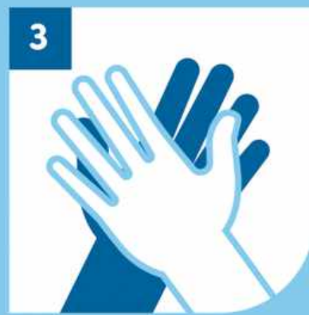
3 PALM TO PALM