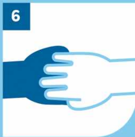
6 BACKS OF FINGERS