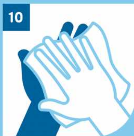
10 USE PAPER TOWEL