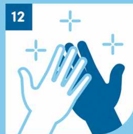
12 YOUR HANDS ARE SAFE