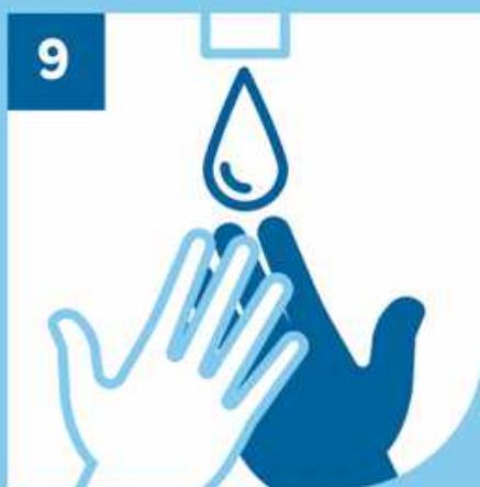
9 RINSE HANDS