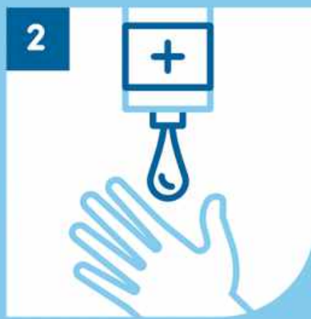
2 APPLY SOAP