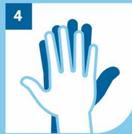
4 PALM OVER DORSUM