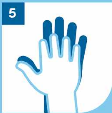
5 FINGERS INTERLACED